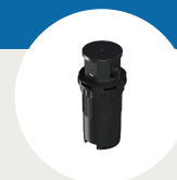
Multi power socket