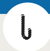
Bench cable tube