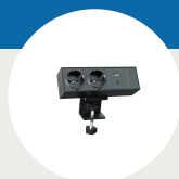
Watt power socket