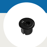
Electrification starter kit