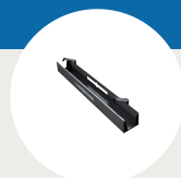
Tiltable cable tray