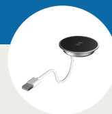
Charge - Wireless charger