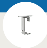
Universal CPU holder