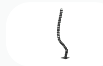
Individual cable tube